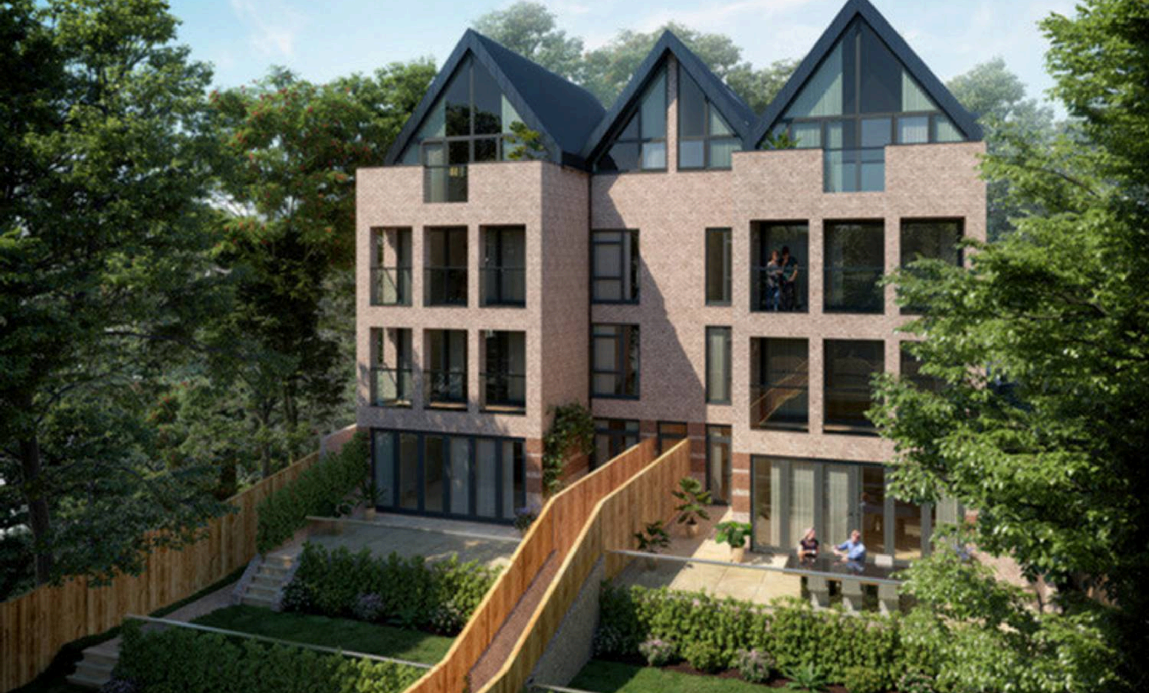
109, Honor Oak Park, London £750,000