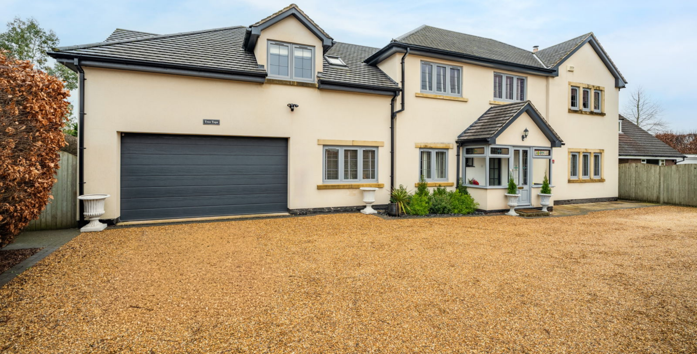
Tree Tops, Peckforton Hall Lane, Spurstow