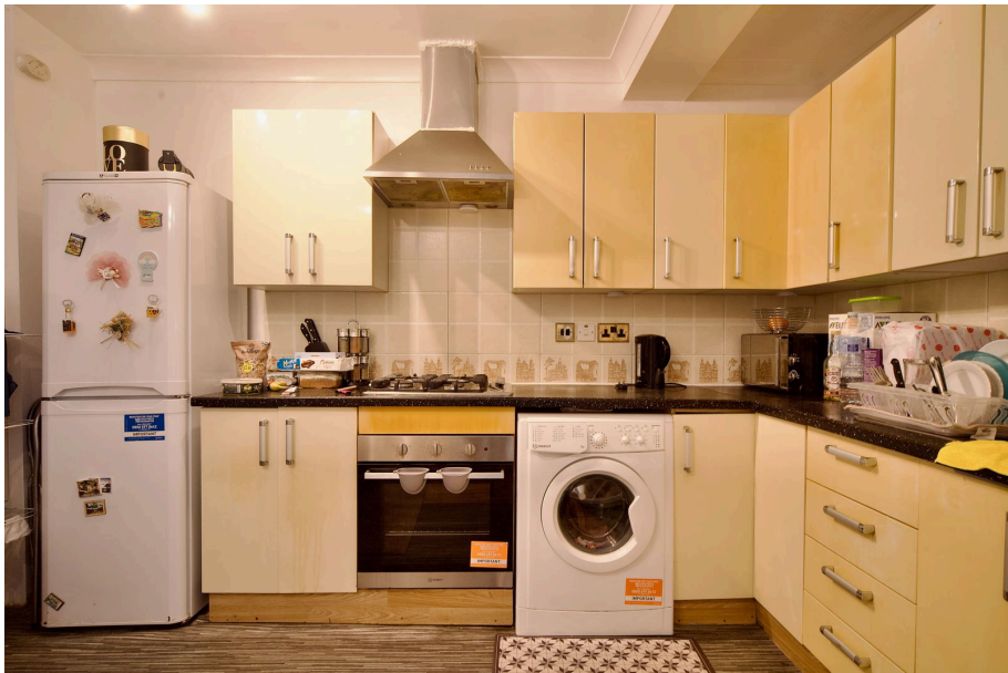
Approximate Gross Internal Area 46.63 sq m / 501.92 sq ft

Stylish Two-Bedroom Apartment in Leytonstone Presenting a beautiful two-bedroom apartment on the first floor of a modern, small block of just eight apartments, perfect for those seeking a contemporary and convenient lifestyle. This well-maintained flat offers two spacious double bedrooms and a bright, open-plan lounge and kitchen area, ideal for modern living and entertaining. The property is being sold chain-free for a hassle-free purchase and comes with a brand-new 125-year lease. Residents have access to attractive communal gardens, providing a peaceful outdoor space to relax and unwind. Located in the highly sought-after area of Leytonstone, the apartment benefits from excellent local amenities, including reputable schools, superb transport links, and the picturesque Wanstead Flats. This is a rare opportunity to own a fantastic home in a vibrant and well-connected neighborhood. Arrange a viewing today. Quote reference number DM008