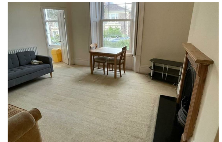
APARTMENT (EPC RATING: D)

121 HFF, BRISTOL, HAMPTON ROAD, REDLAND, BS6 6JG