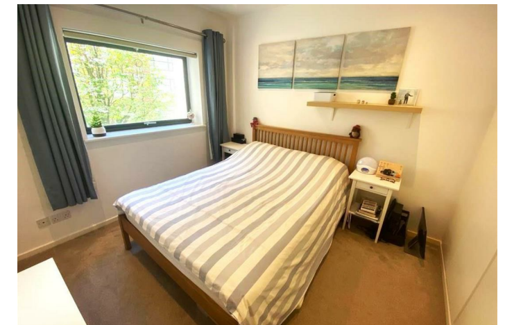
APARTMENT (EPC RATING: C)

THE GRAIN LOFT, FLAT 3, 1 QUEEN SQUARE AVENUE, BRISTOL, BSI 4JA PER MONTH