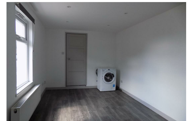
HOUSE - END TERRACE (EPC RATING: C)