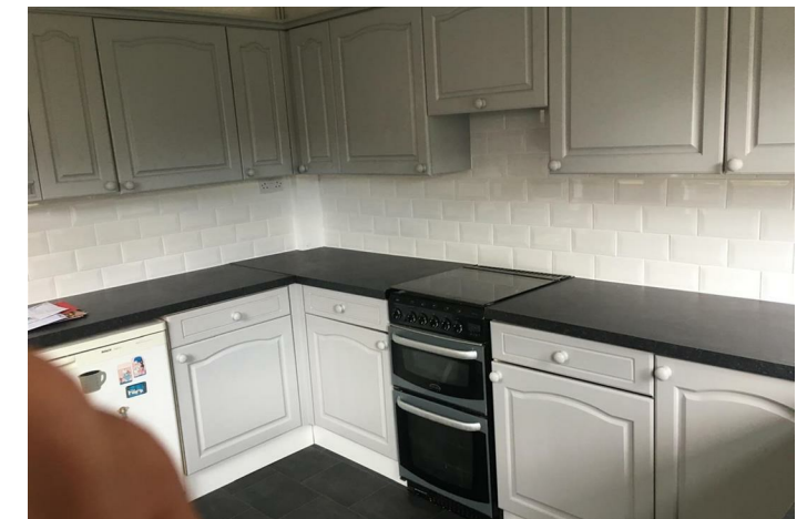
HOUSE - TERRACED (EPC RATING: D)