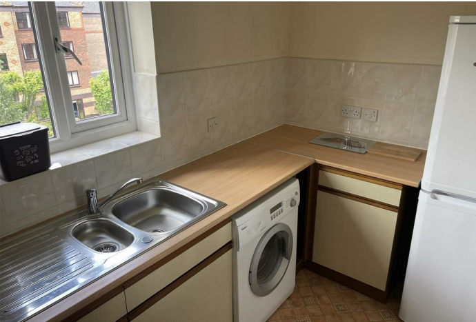
APARTMENT (EPC RATING: C)