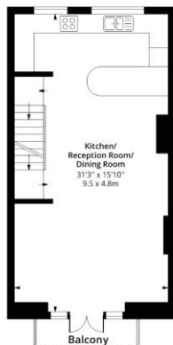
First Floor Floor Area 488 Sq Ft - 45.33 Sq M