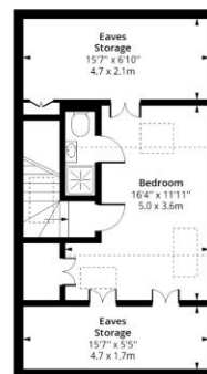
Third Floor Floor Area 248 Sq Ft - 23.04 Sq M

Floor plan is for illustrative purposes only and is not to scale. Every attempt has been made to ensure the accuracy of the floor plan shown, however all measurements, fixtures, fittings and data shown are an approximate interpretation for illustrative purposes only.