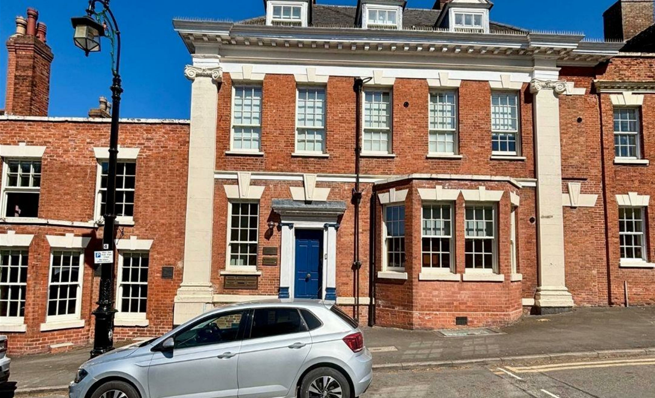
Church Hill, Birmingham, B46 3AD