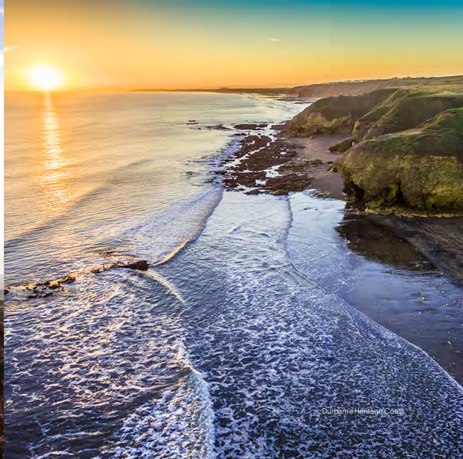
Durham's Heritage Coast