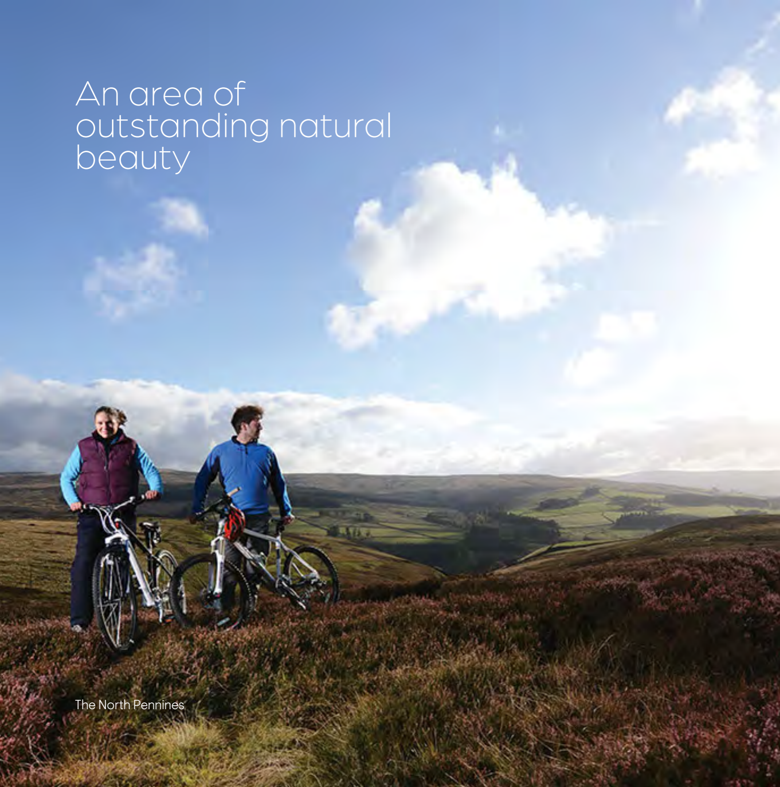
The North Pennines