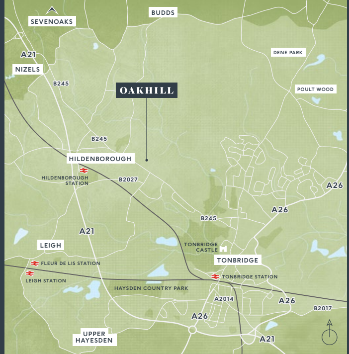
Maps not to scale and show approximate positions only.