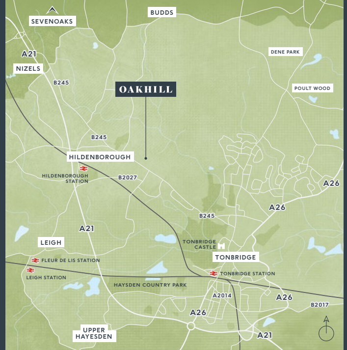
Maps not to scale and show approximate positions only.