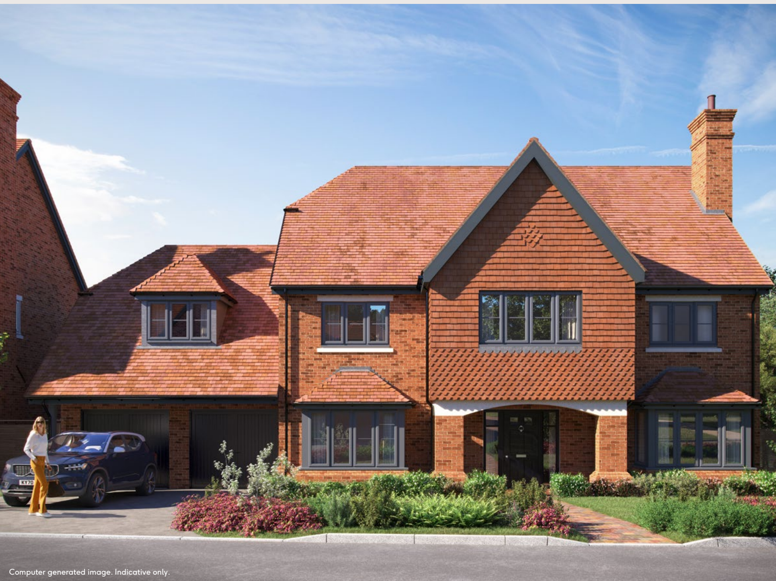
Computer generated image. Indicative only.