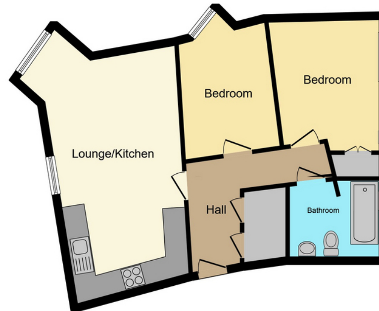
Floor Plan Floor area 56.5 m 2 (609 sq.ft.)