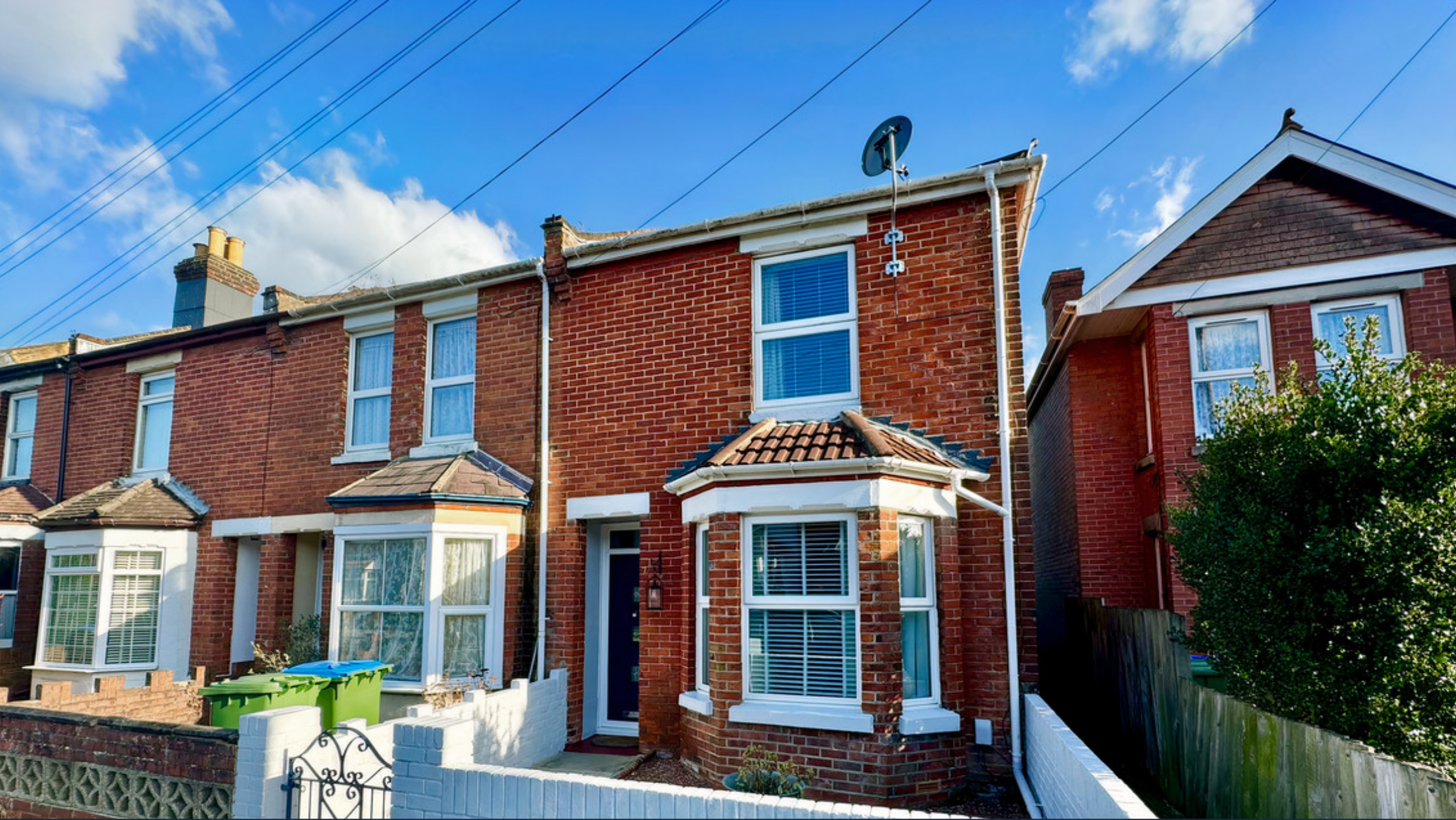
Clarendon Road, Shirley SOUTHAMPTON, SO16 4GG - £290,000