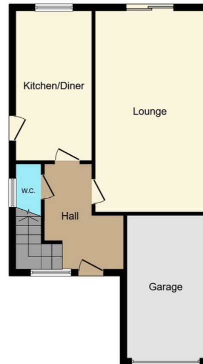
Ground Floor Floor area 55.3 m 2 (595 sq.ft.)