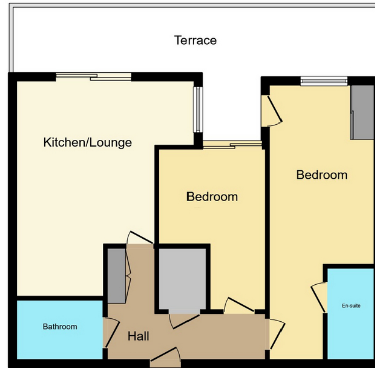
Floor Plan Floor area 59.0 sq.m. (635 sq.ft.)