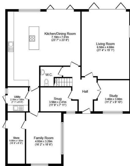
Ground Floor Floor area 138.3 sq.m. (1,489 sq.ft.)