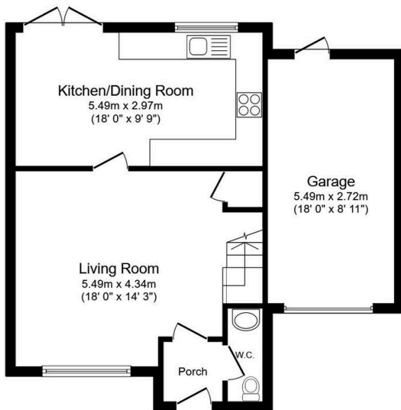
Ground Floor Floor area 58.2 m 2 (627 sq.ft.)