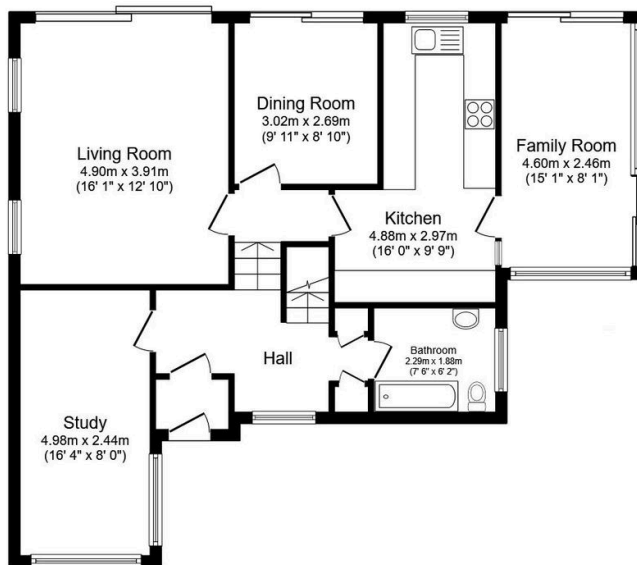
Ground Floor Floor area 83.8 m 2 (901 sq.ft.)