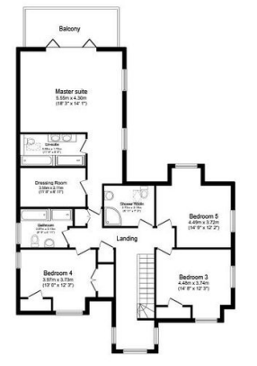
First Floor Floor area 123.8 sq.m. (1,333 sq.ft.)