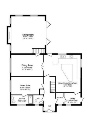
Ground Floor Floor area 131.5 sq.m. (1,416 sq.ft.)