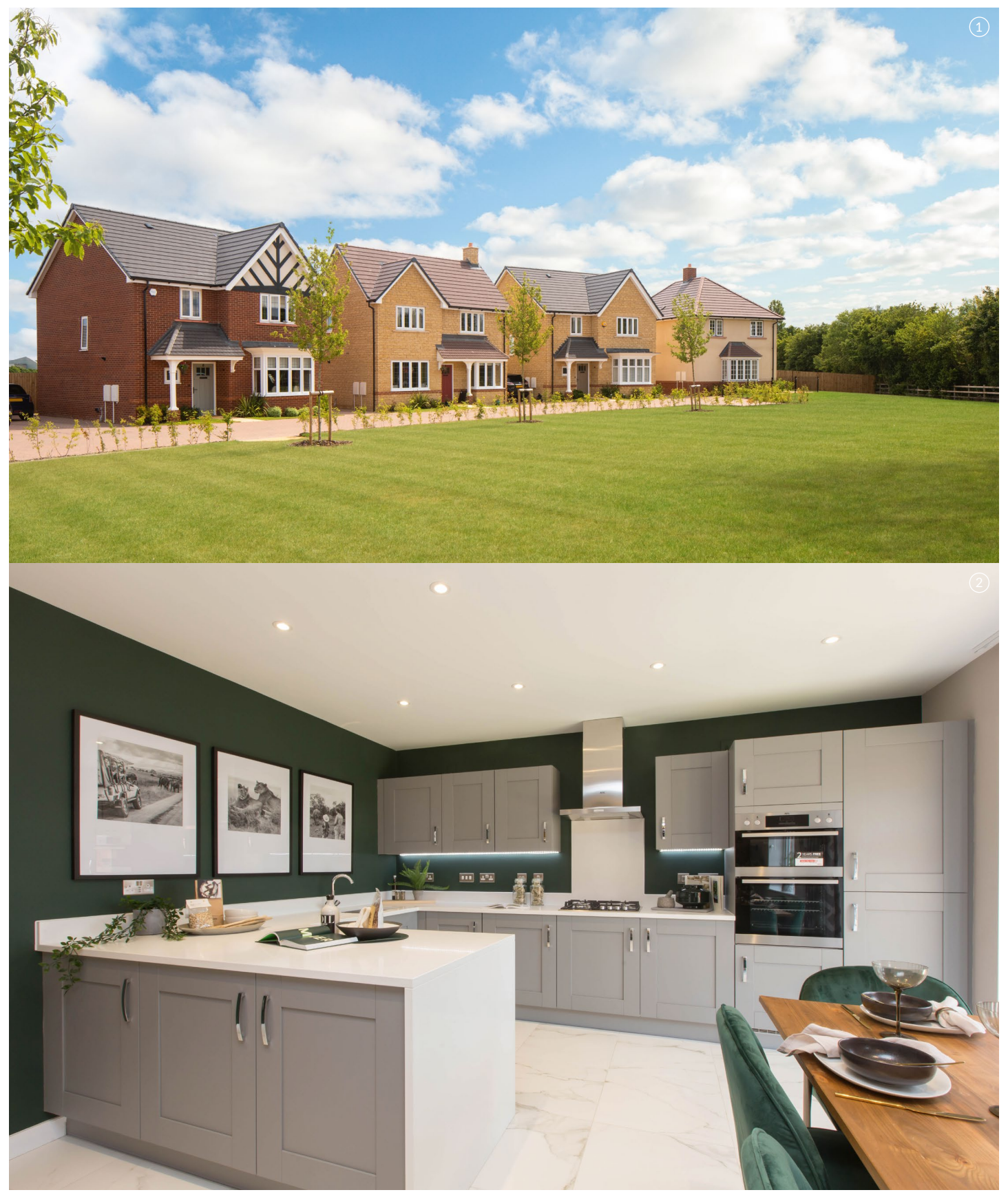
\textcircled{1} \hookrightarrow \mathsf{Typical Bloor Homes} \qquad \fbox{2} \hookrightarrow \mathsf{Typical Interior}