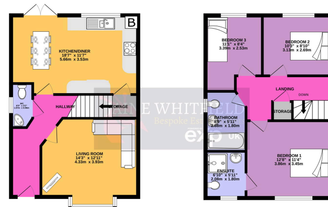
1ST FLOOR 503 sq.ft. (46.7 sq.m.) approx.

TOTAL FLOOR AREA - 1006 sq.ft. (93.5 sq.m.) approx. While every attempt has been made to ensure the accuracy of the floorplan, measurements of doors, windows, rooms and any other items are approximate and no responsibility is taken for any errors. Windows or other elements may not be shown to scale. The floorplan is for illustrative purposes only and should be used as a guide only. No prospective purchaser should rely on the floorplan and no guarantee as to their accuracy or efficiency can be given. Made with Metreage (2021)