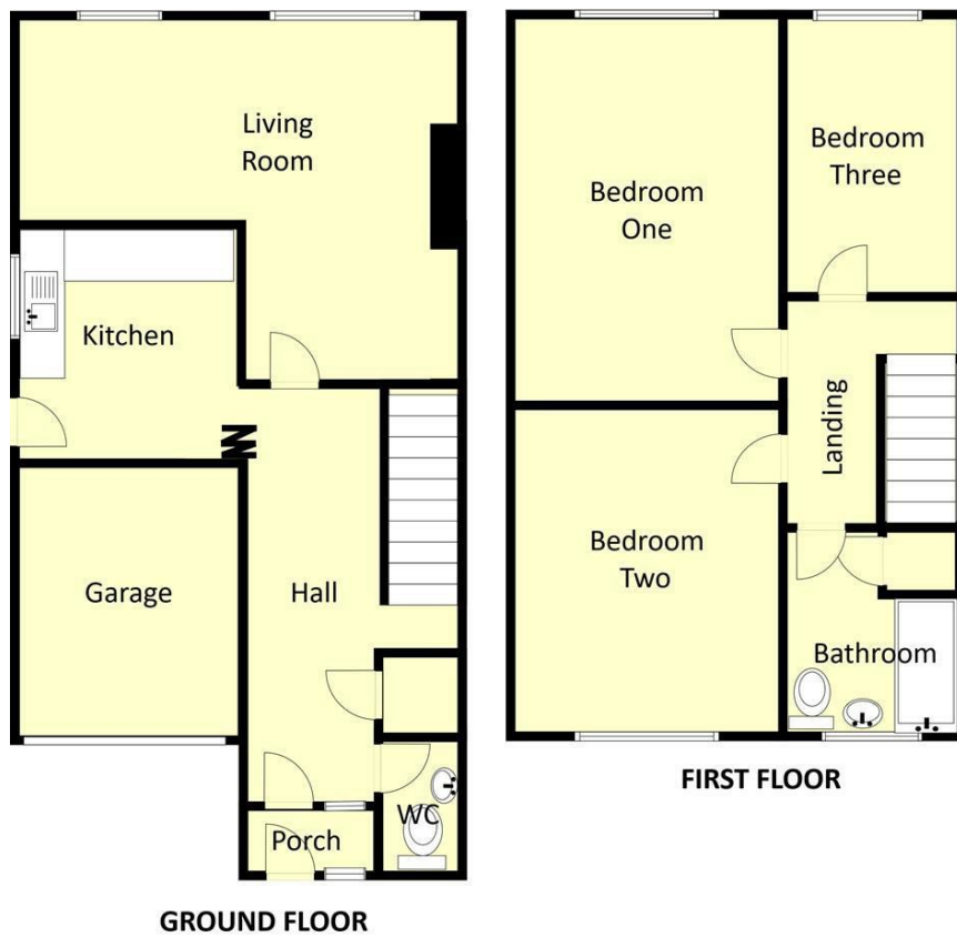
Manitoba Croft For illustrative purposes only, NOT to scale.