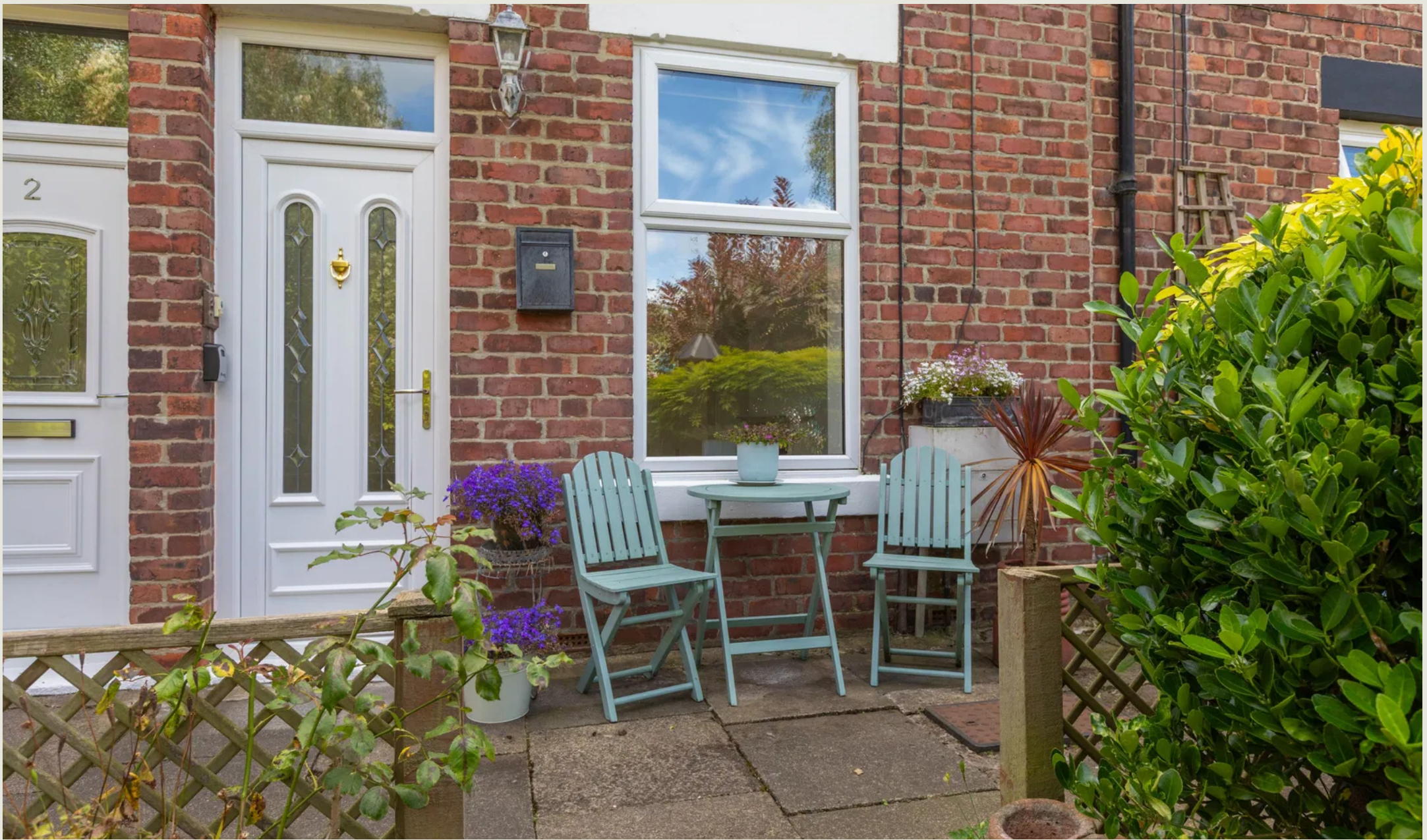
North View, Preston Village, North Shields, NE29 9LS £125,000