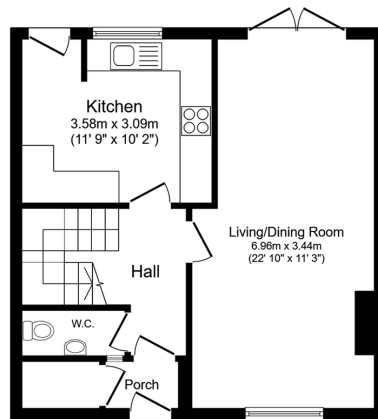
Ground Floor Floor area 46.2 sq.m. (497 sq.ft.)