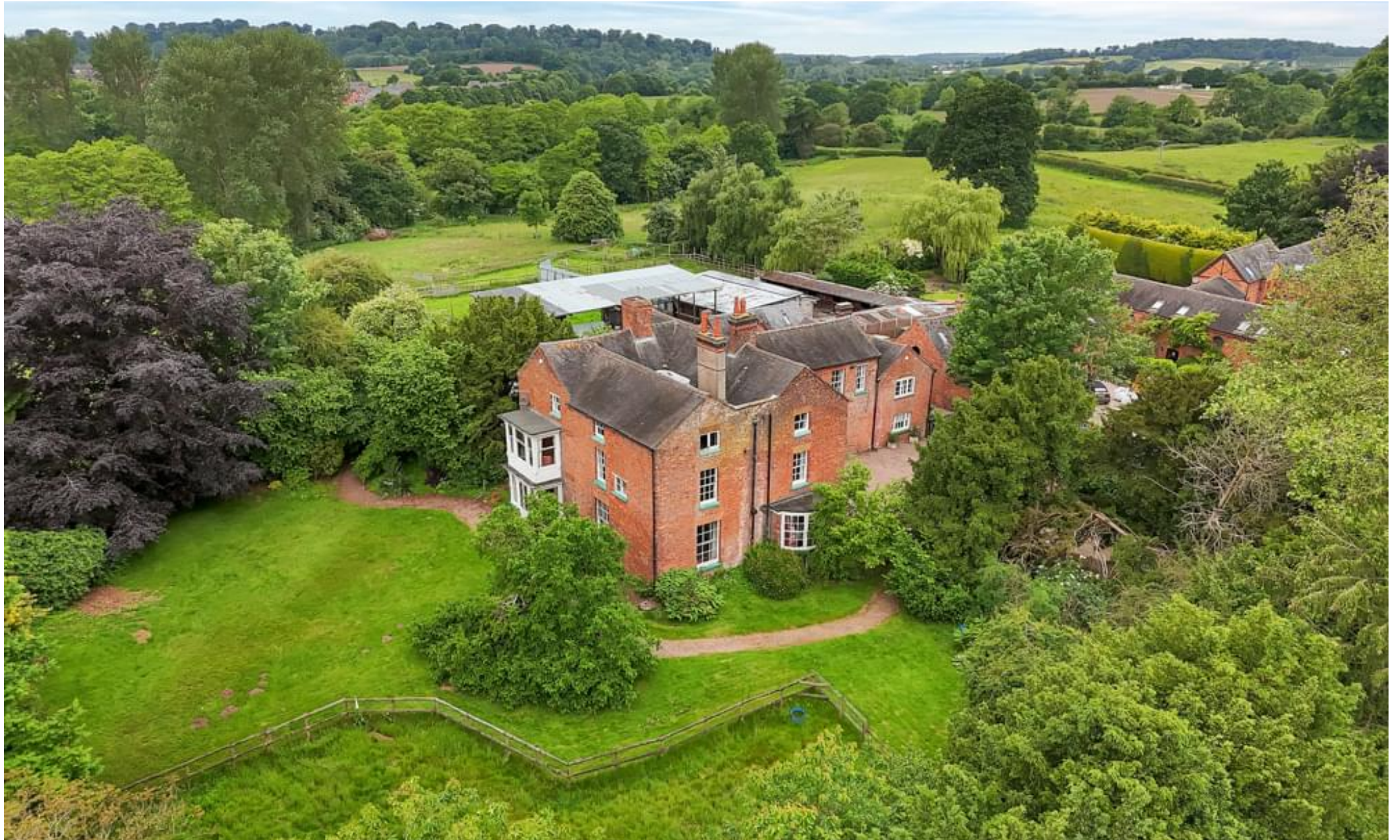
Meretown House, Meretown, Newport, Staffordshire