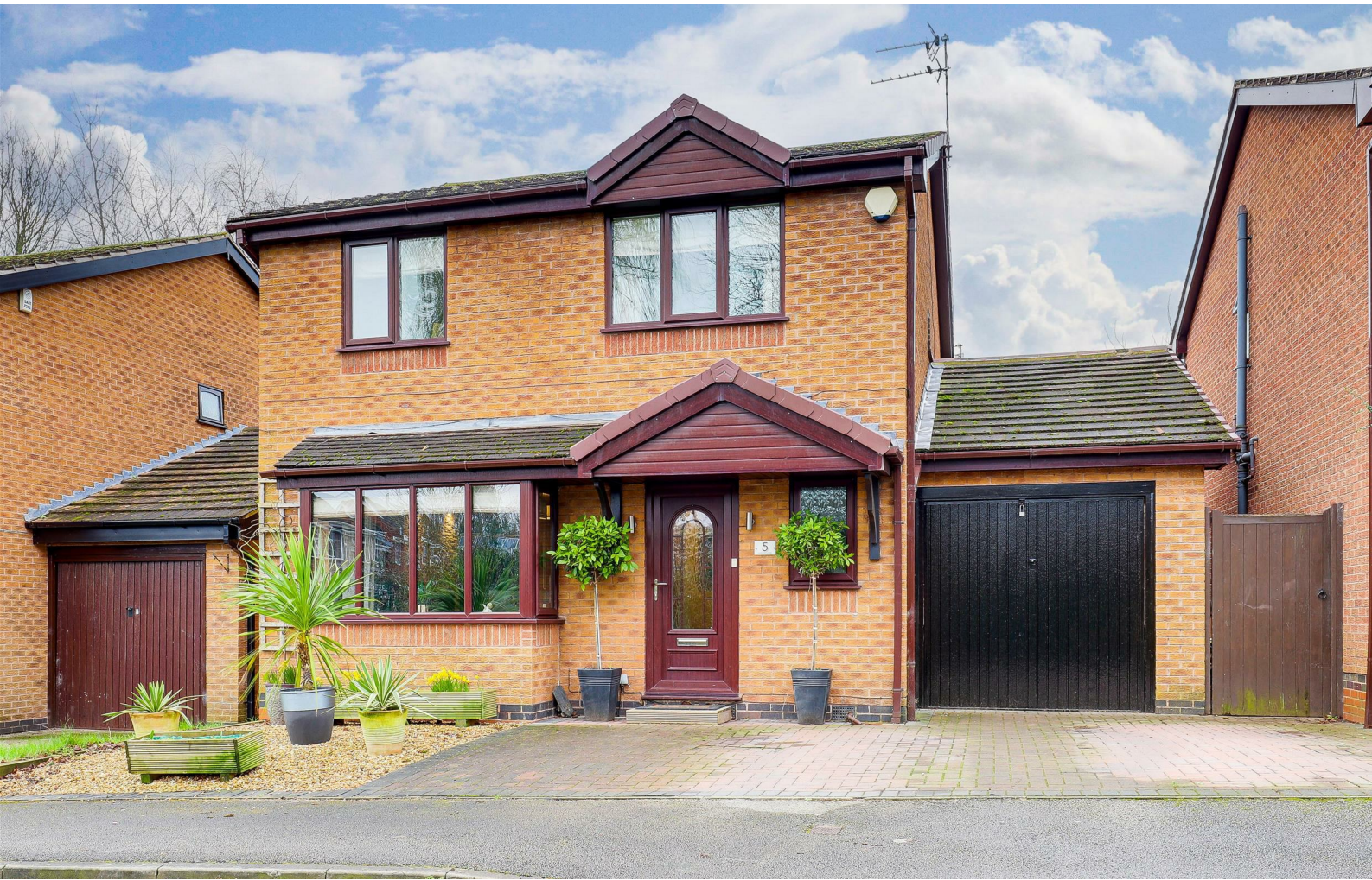
Saltford Close, Gedling, Nottinghamshire NG4 4BD