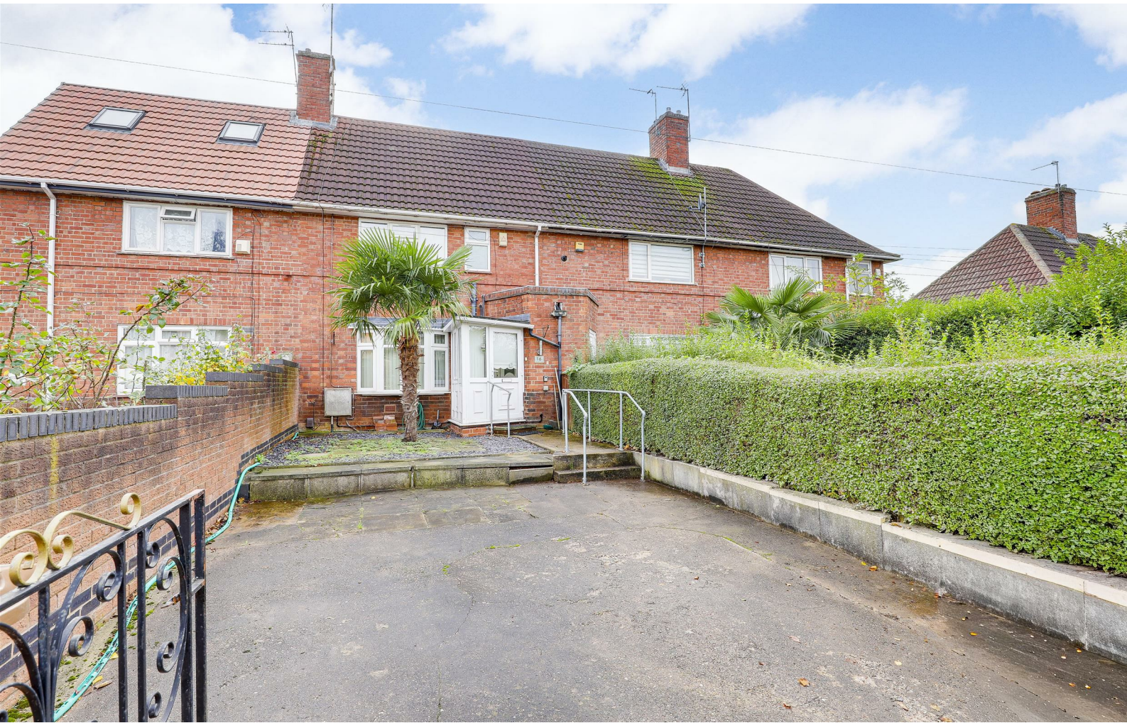
Cardale Road, Bakersfield, Nottinghamshire NG3 7BS