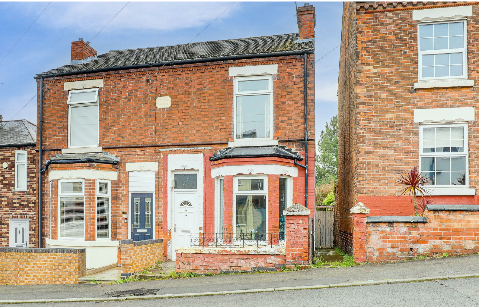
Forester Grove, Carlton, Nottinghamshire NG4 1FR