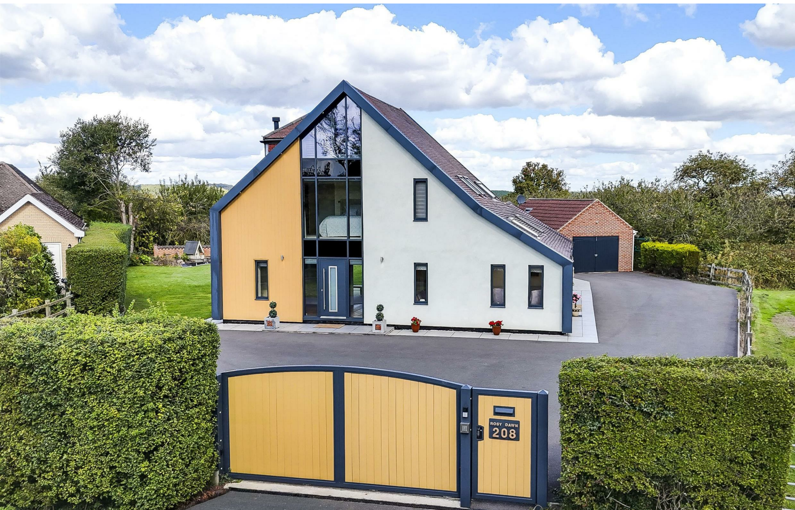
Spring Lane, Lambley, Nottinghamshire NG4 4PE