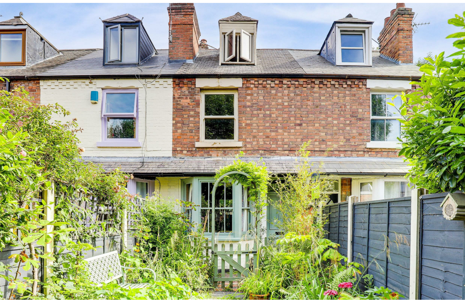
Peel Villas, Mapperley, Nottinghamshire NG3 5HZ