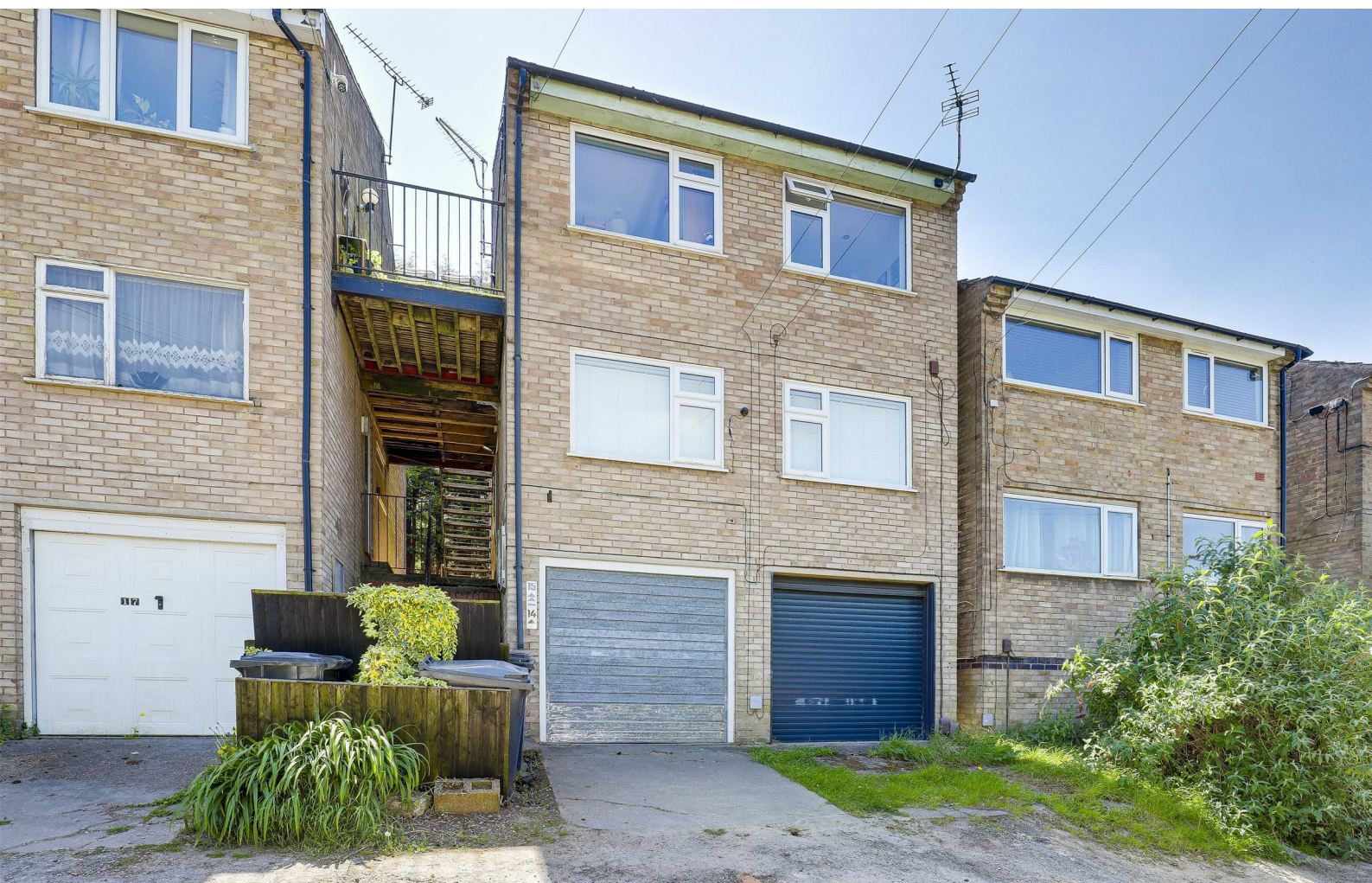
Beckett Court, Gedling, Nottinghamshire NG4 4GS