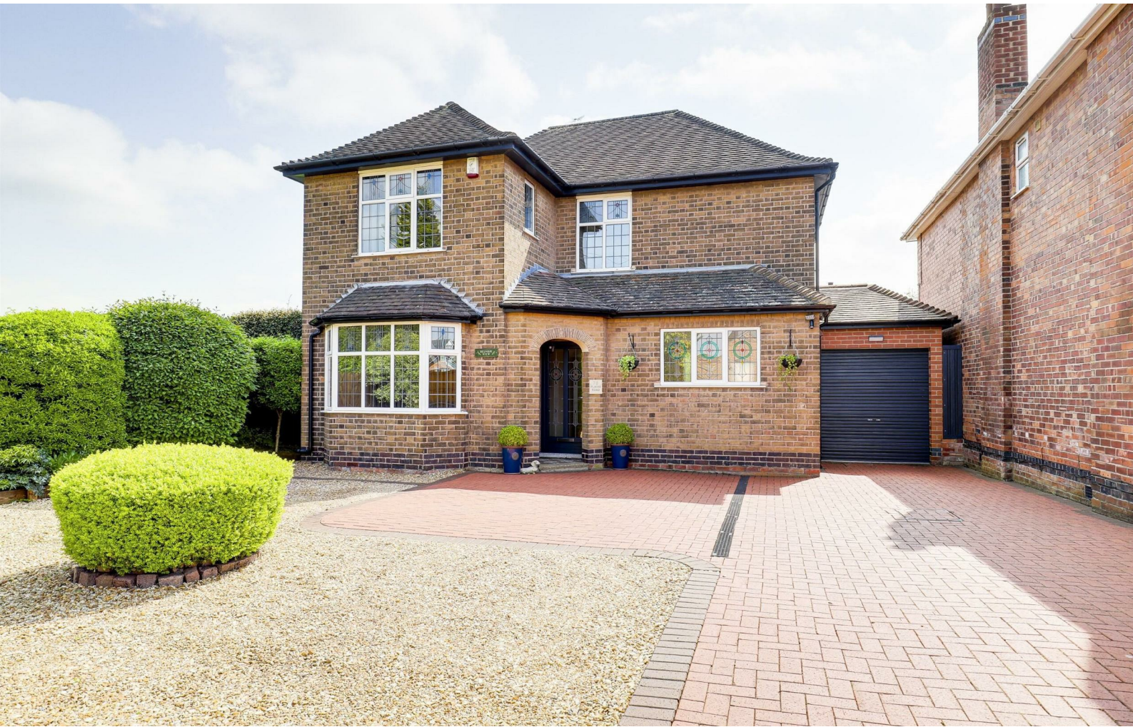
Plains Road, Mapperley, Nottinghamshire NG3 5LE