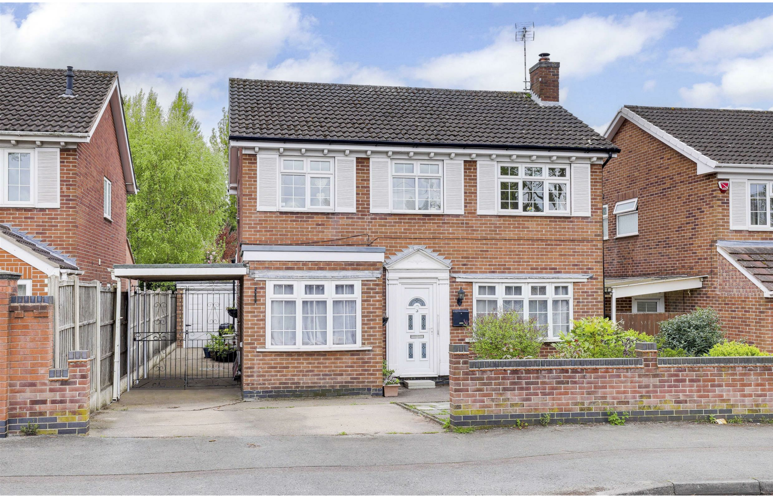
Elmhurst Avenue, Mapperley, Nottinghamshire NG3 6GF