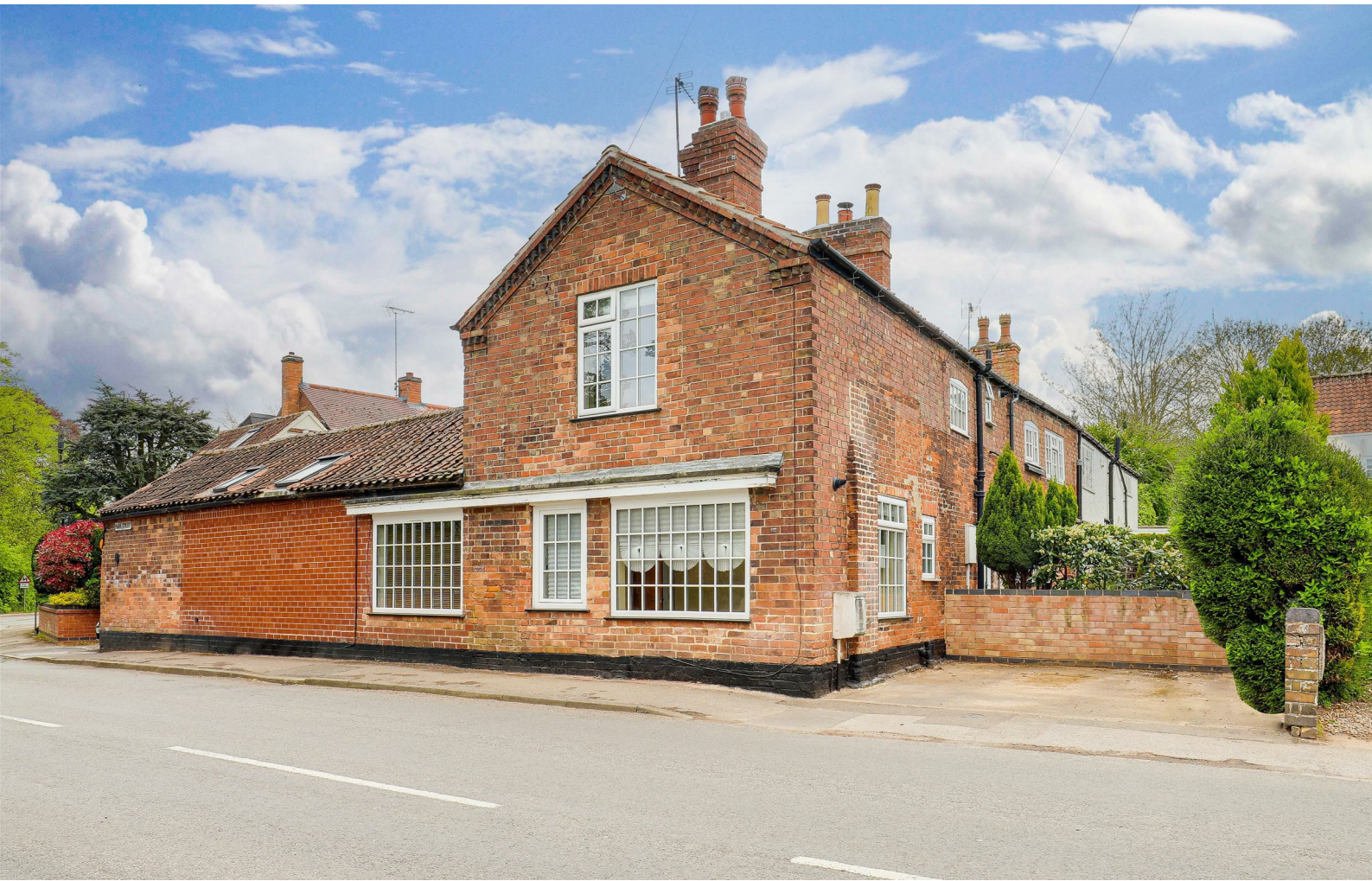
Main Street, Lambley, Nottinghamshire NG4 4PP