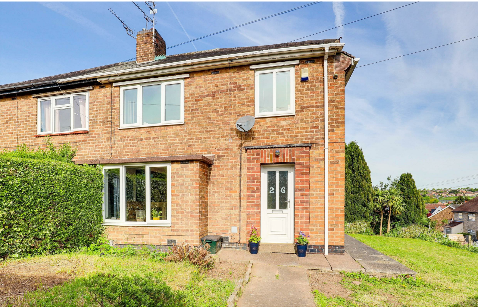
Campbell Drive, Carlton, Nottinghamshire NG4 1RD