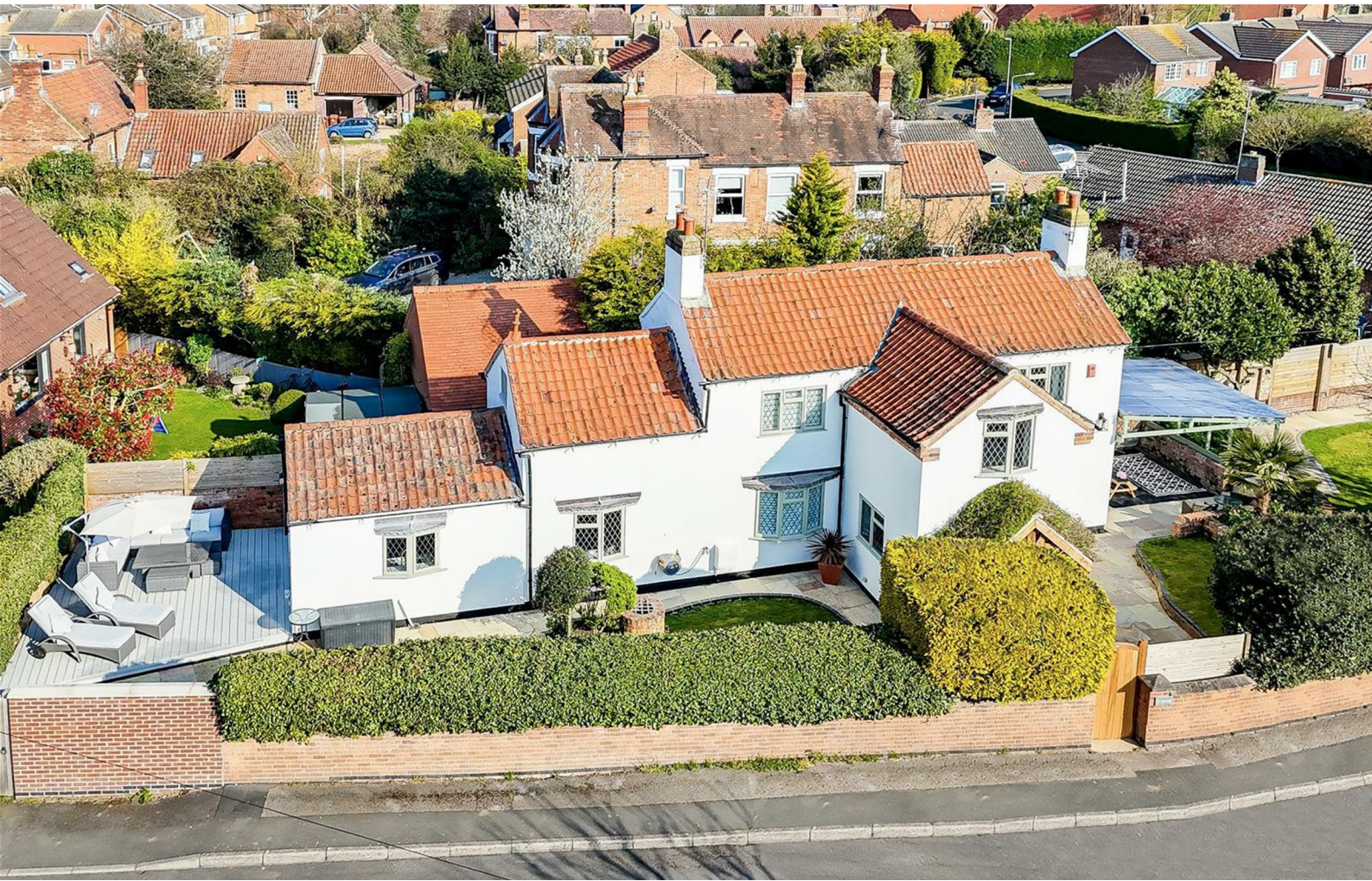
Davids Lane, Gunthorpe, Nottinghamshire NG14 7EW