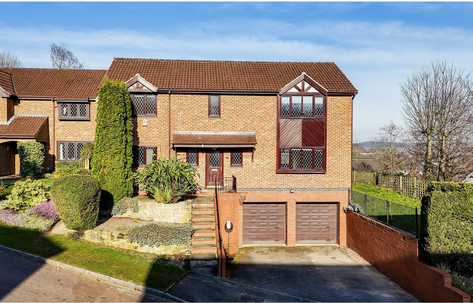
Weston Close, Woodthorpe, Nottinghamshire NG5 4FS