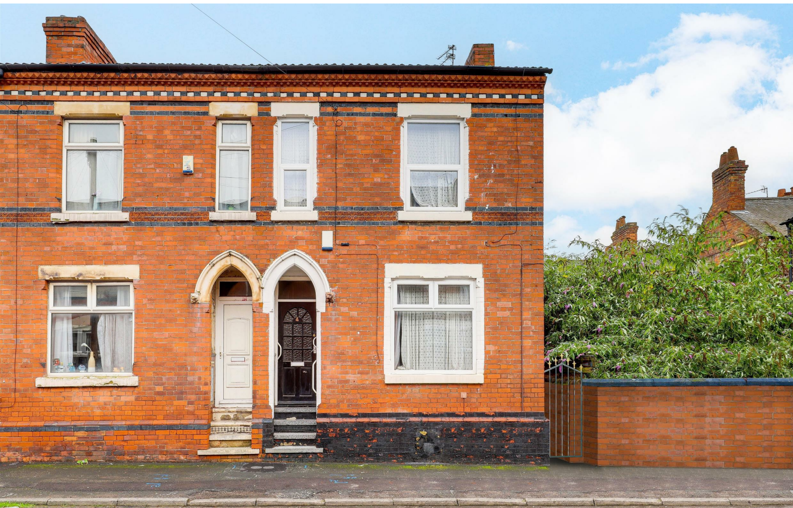
St. Christopher Street, Nottingham, Nottinghamshire NG2 4FG