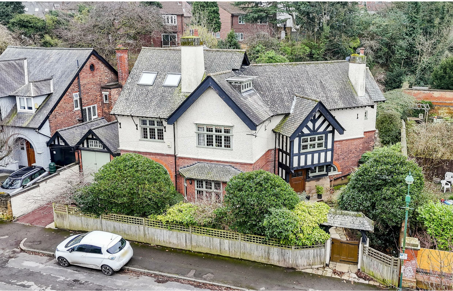
St. Andrews Road, Mapperley Park, Nottinghamshire NG3 5BP