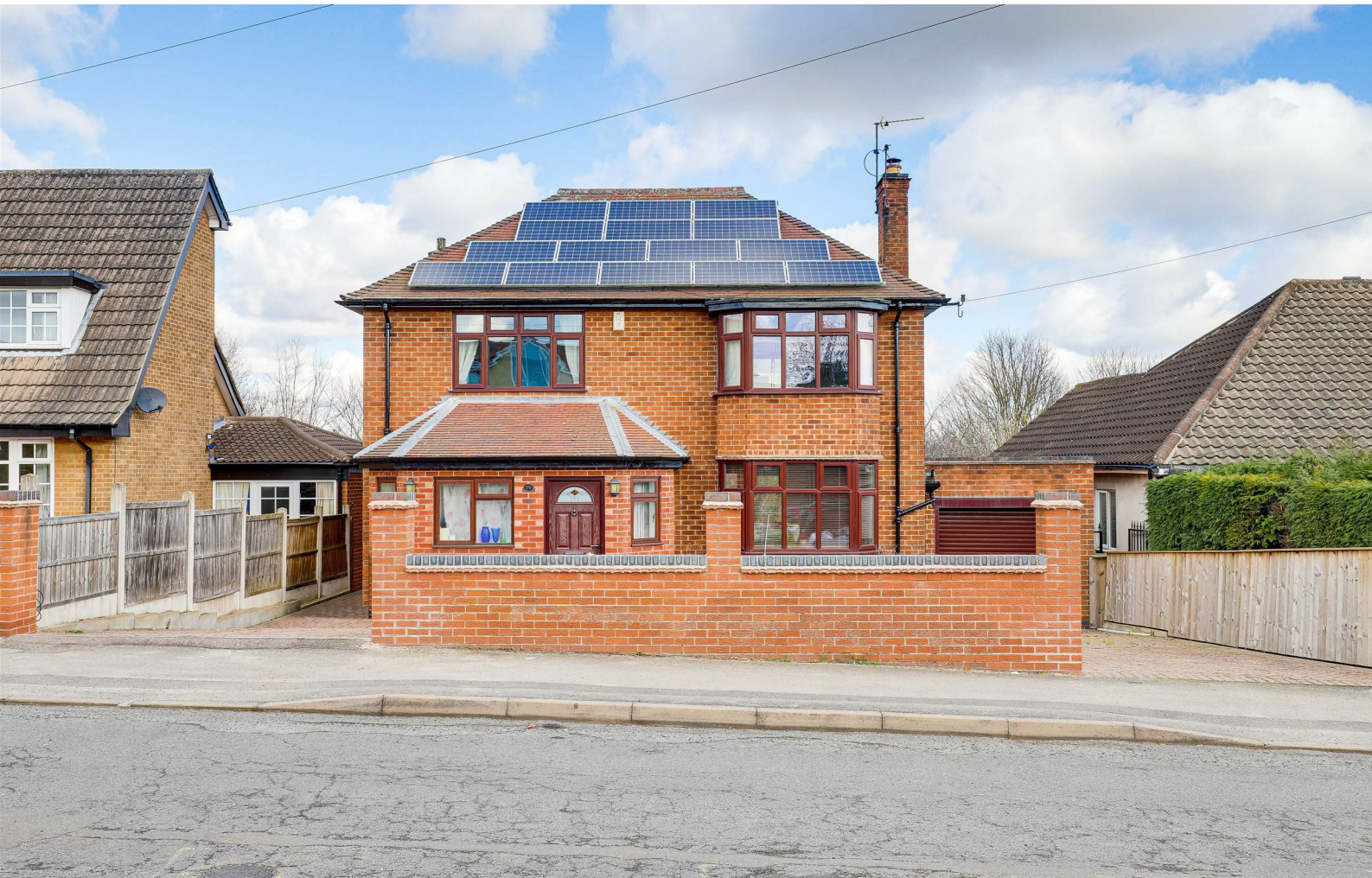
Digby Avenue, Mapperley, Nottinghamshire NG3 6DS