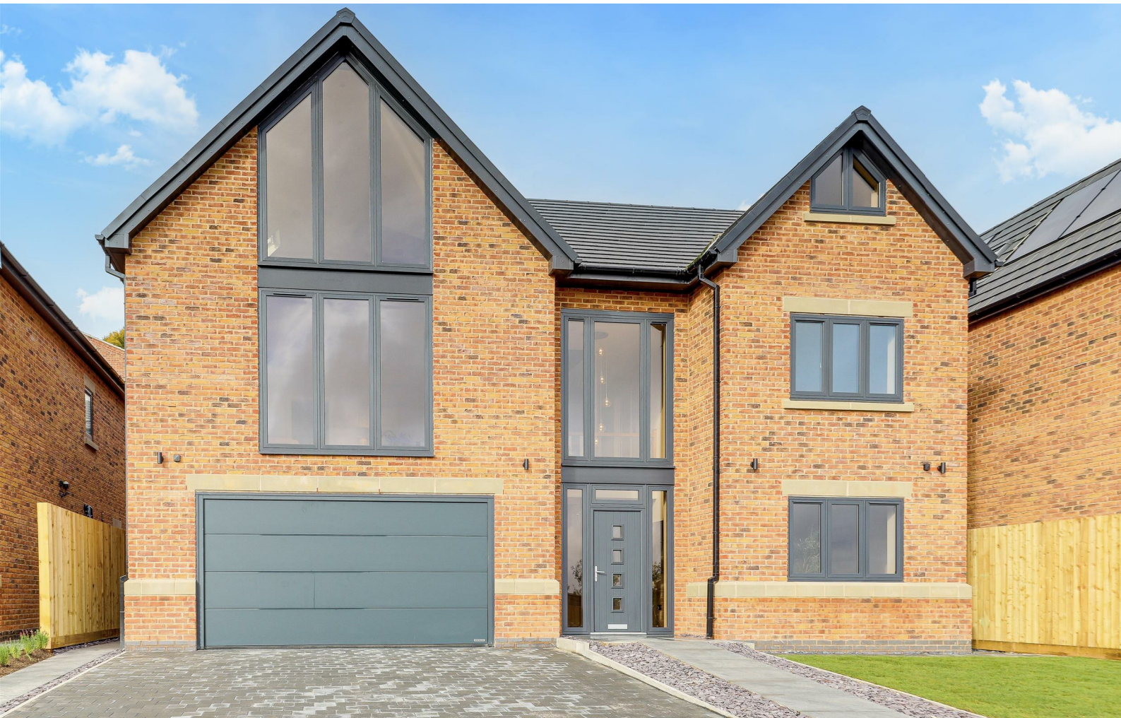
Bailey Drive, Mapperley, Nottinghamshire NG3 5US