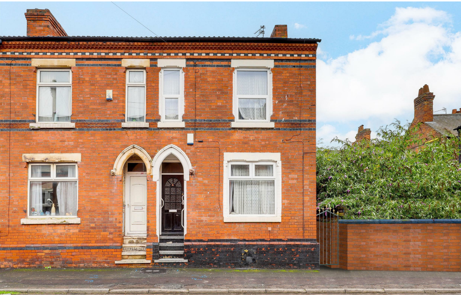
St. Christopher Street, Nottingham, Nottinghamshire NG2 4FG