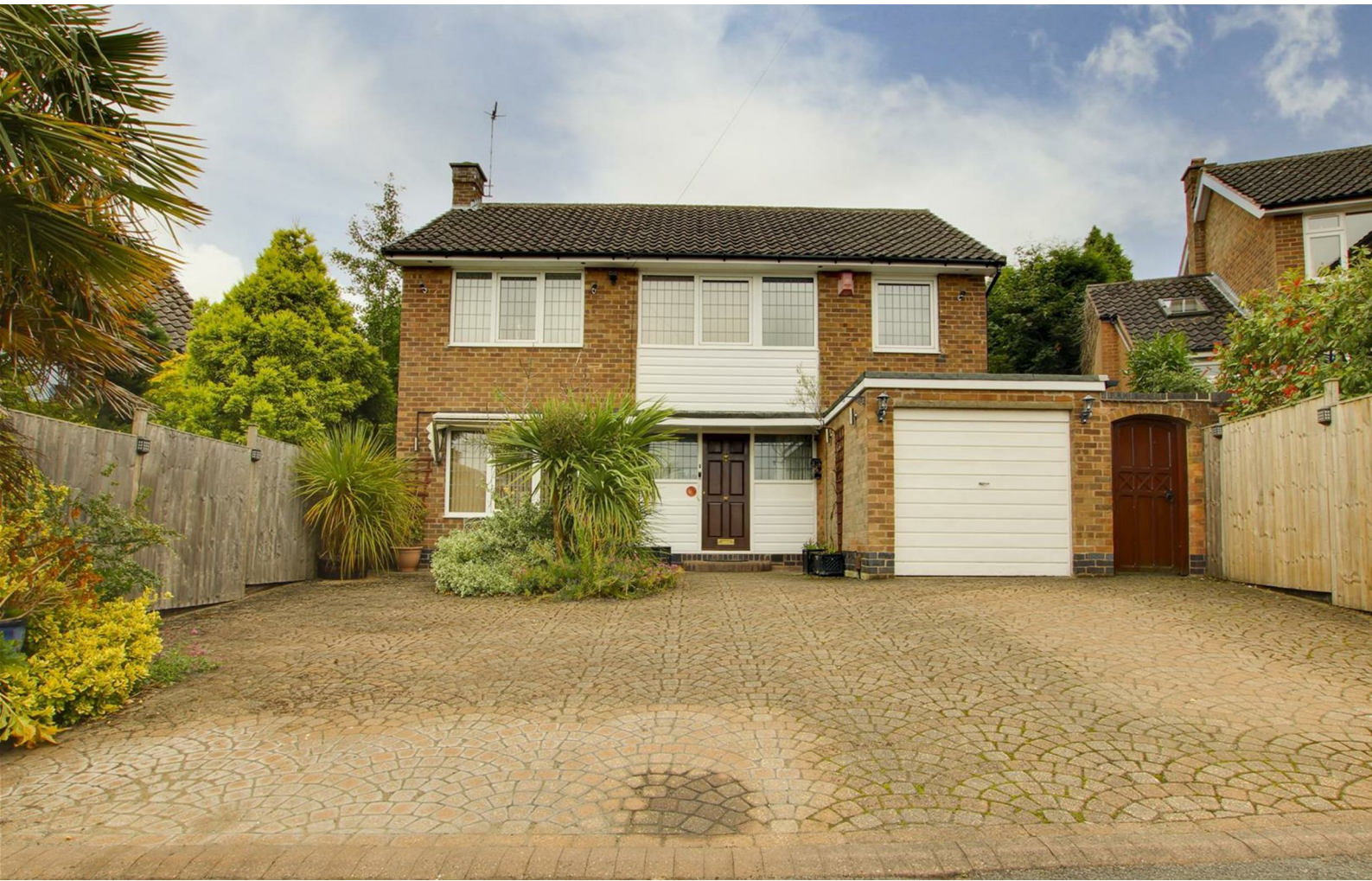
Cambridge Gardens, Woodthorpe, Nottinghamshire NG5 4NS