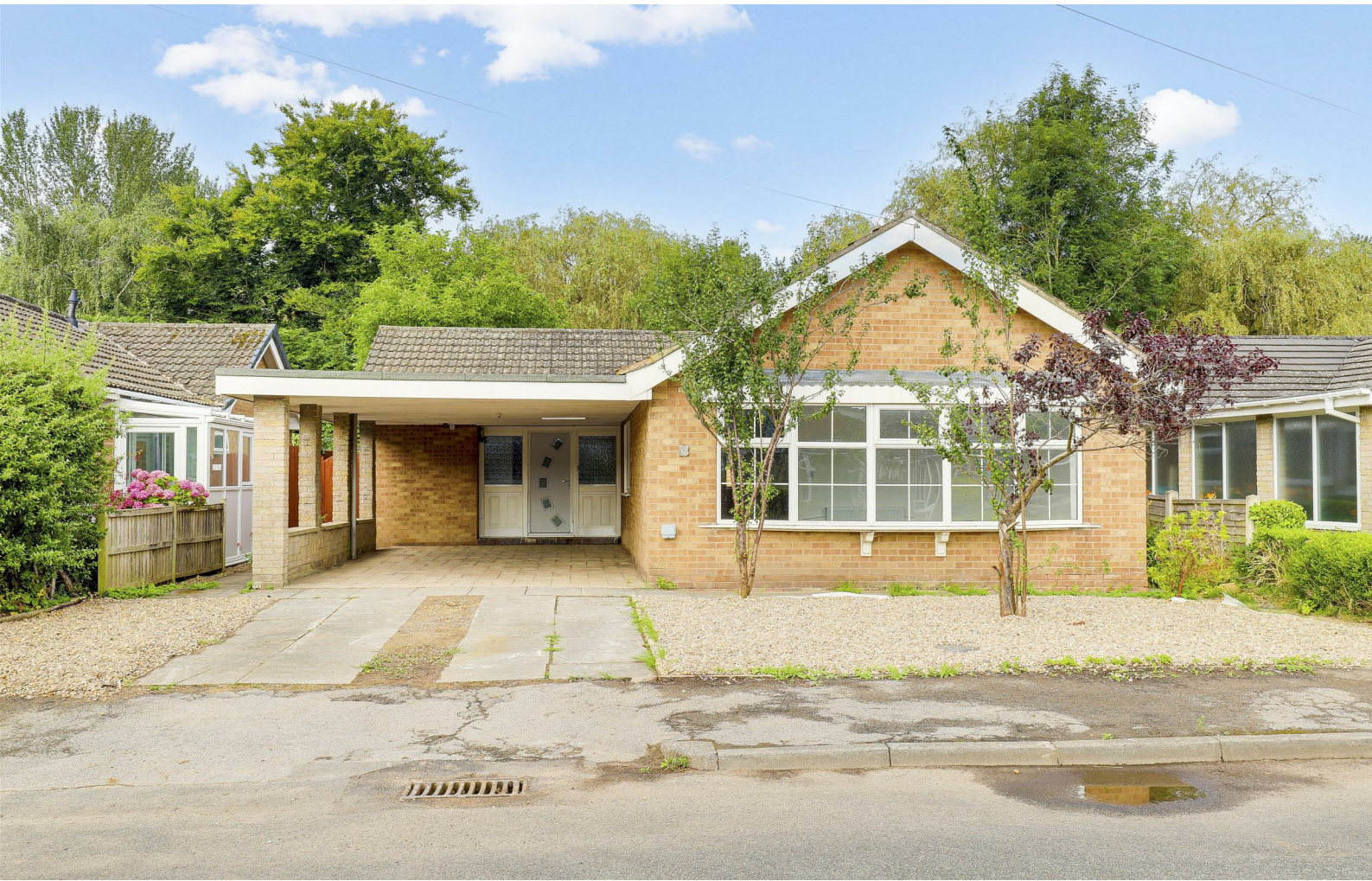
The Priors, Lowdham, Nottinghamshire NG14 7BA