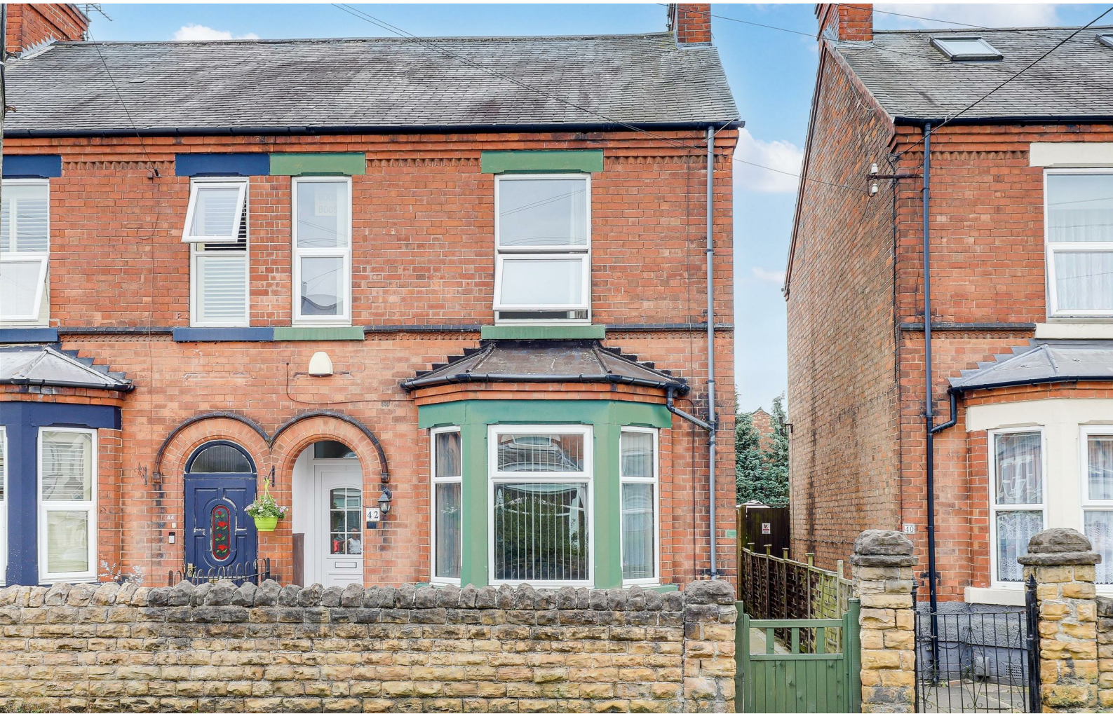
Chandos Street, Netherfield, Nottingham NG4 2LS