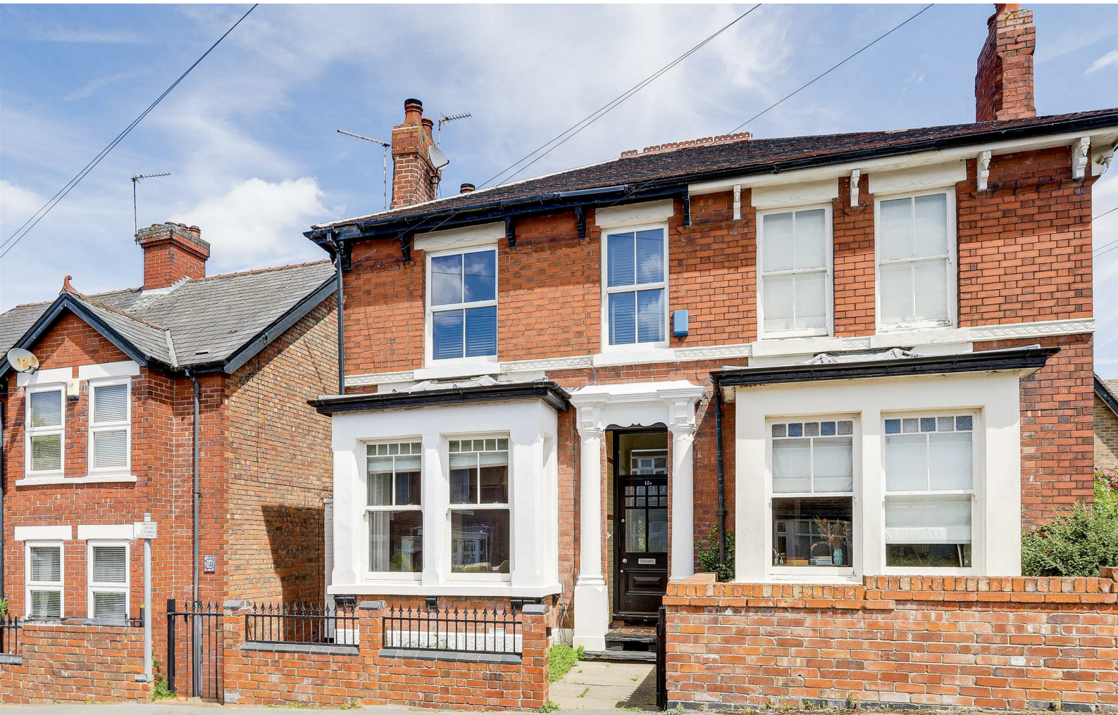
Gretton Road, Mapperley, Nottinghamshire NG3 5JT