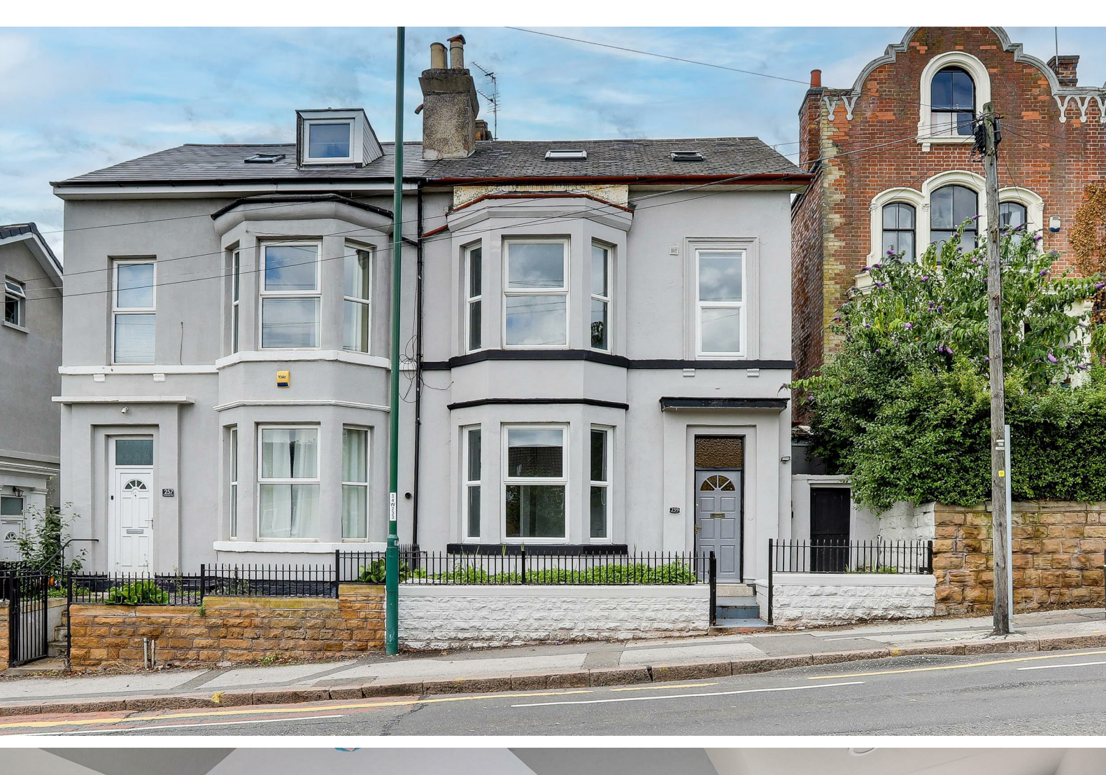
Woodborough Road, Mapperley, Nottinghamshire NG3 4JZ