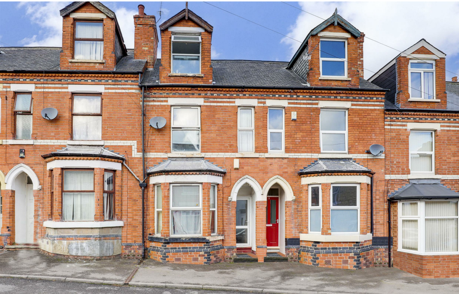
Bleasby Street, Sneinton, Nottinghamshire NG2 4FR